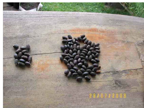
Remineralized Jatropha produces a higher yield of oil-bearing seeds

(Todd, 2008). Over a thousand trees of more than 20 species were planted. Half of the trees received three kilograms of basalt rock powder. Jatropha