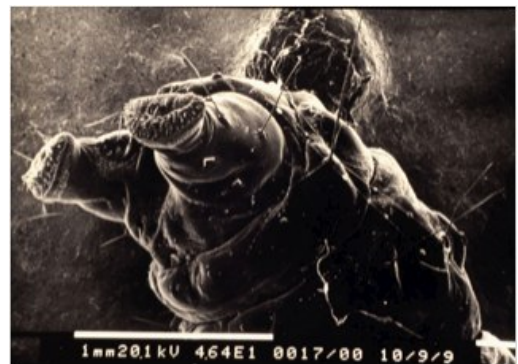
This microscopic photo shows a rock dusted insect disabled as the dust penetrates segments and organs.

of resistant pests. A farmer spraying insecticides on his fields is unintentionally breeding weak plants and strong insects. Any responsible approach to short-term pest control